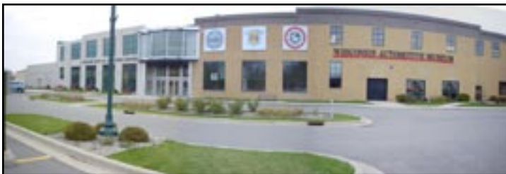
The Wisconsin Automotive Museum

In June of 2006, the Wisconsin Automotive Museum of Hartford, Wisconsin celebrated twenty years of operation as well as the 100th year since the birth of the Kissel Motor Car Company in Hartford. The museum opened its doors to the public on July 26, 1986 after remodeling a portion of the former Libby Cannery that had been donated to the Hartford Heritage Auto Museum (now the Wisconsin Automotive Museum). At that first opening, with the museum motto "Showcasing Transportation History" 46 vintage cars were shown on 30,000 square feet of display space. Since that time the display area more than doubled and the collection increased to 100 cars and trucks. In the past seven years many improvements have been made to the building and a second story was added. A new building façade was also added along with a new entrance.