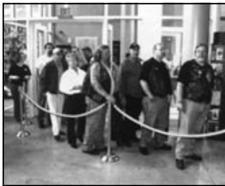
Visitors lined up through the lobby and out onto the parking lot.