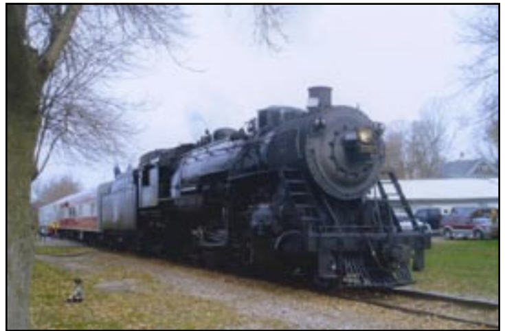
A favorite museum display is the huge Soo Line 1003 steam locomotive.

Studebakers. Railroad buffs are in for a treat, a 250-ton 1913 Steam Locomotive was added to the museum and is on exhibit except for the occasional trips in the Midwest. Lately, it's been part of the Circus Train, the Christmas train, and various local celebrations.