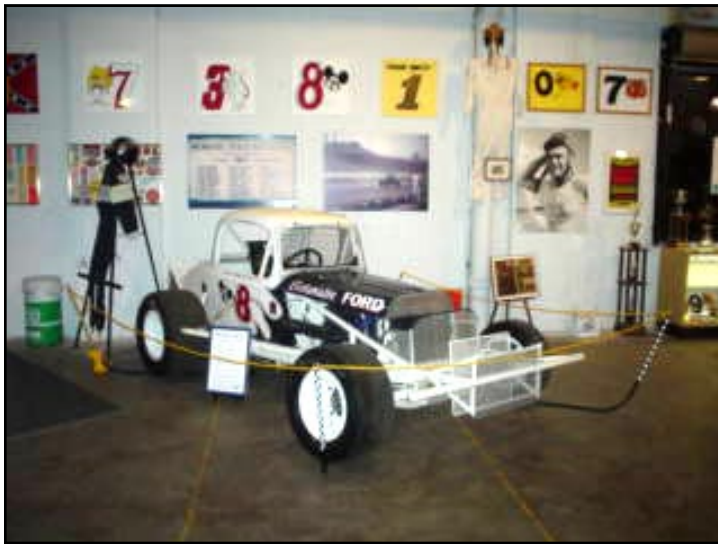
Dirt Track Hall of Fame race cars.

directors. After two years of negotiations with the cannery owners, a 165,000 square foot building on 12 or more acres in downtown Hartford was donated by "Quit Claim Deed". Capitalizing on Hartford's long automotive history, the cannery was gradually remodeled and expanded over the next two years and opened with an eye toward Kissel, Nash, and Hudson cars. The museum has received DOT grants totaling $730,000 for remodeling and replacing old building systems. Various expansions continue to this day. The museum is now the home of the Southeastern Wisconsin Dirt Track Hall of Fame with a special display area for their materials and three or four vintage modified race cars. And, the Performing Arts and Activities Center with a 600-seat theater is housed in the museum and is a major source of income for the museum. The museum recently donated five acres to the city of Hartford for construction of a Recreation/Aquatic Center on the property.