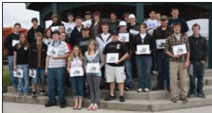
2008 High School Car Show Students, June 1 st .