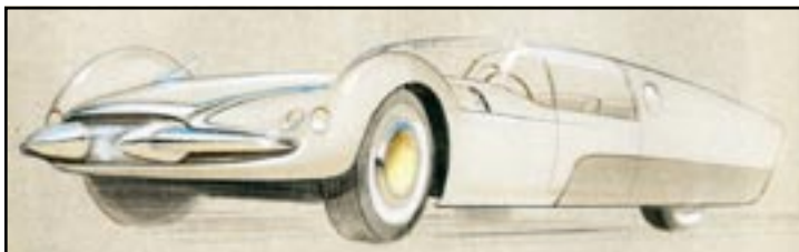
Robert Bourke Styling Proposal from 1954

Studebaker National Museum is located at 201 S. Chapin Street in downtown South Bend. It is open Monday-Saturday, 10:00 a.m.-5:00 p.m., and Sunday 12:00 p.m.-5:00 p.m. Admission is $8.00 for adults, $6.50 for seniors over 60, and $5.00 for youth ages 6-18. For more information call the museum at (574) 235-9714 or toll free at 1-888-391-5600 or visit our web site at www.studebakermuseum.org .